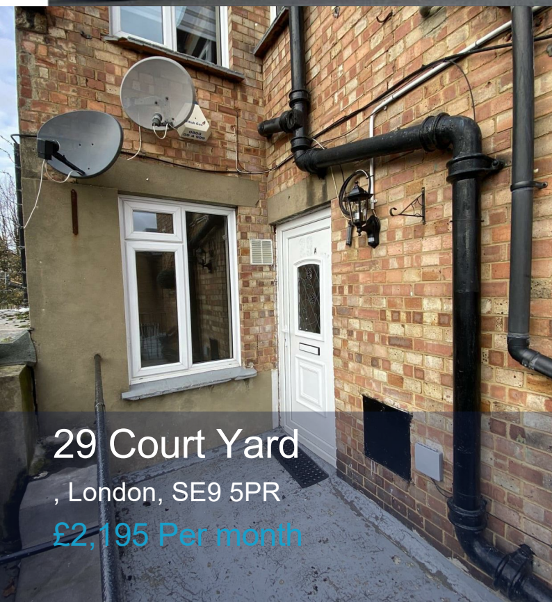
29 Court Yard , London, SE9 5PR £2,195 Per month